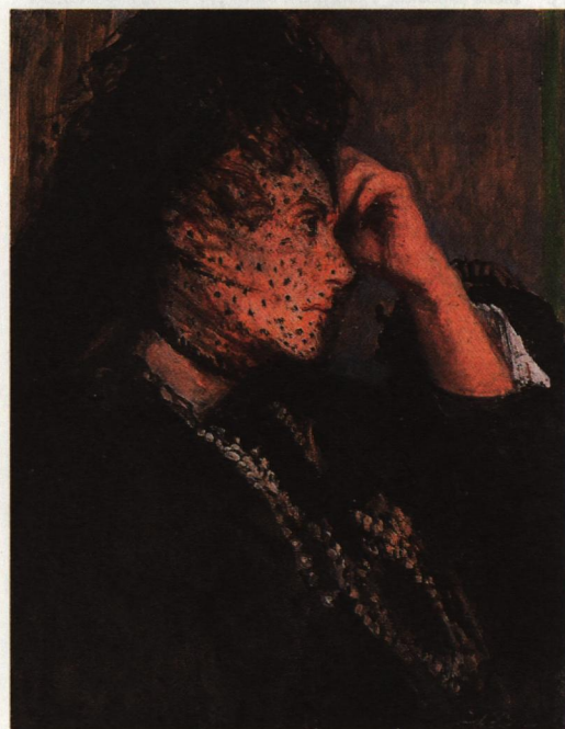
01 Pierre-Louis Pierson, Untitled (Pensive) , 1893, albumen print