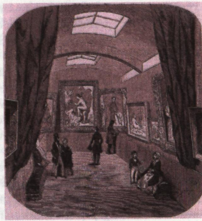
09 The first survey exhibition of French painting in a commercial gallery on the Boulevard Bonne-Nouvelle in Paris, 1846, from L'illustration , February 1846

Such speculation requires the poncif , needs the woman on the haystack that Zola ridicules in his critique. It needs fashion. In order to furnish the walls of the rich with paintings a mere fulfilment of demand did not suffice, since such a demand did not exist in the art market. It had to be created first, had to be artificially and artfully generated. This was done either by causing a scarcity of existing art – thus Durand-Ruel bought up the entire estate of artists like Théodore Rousseau, including unfinished and abandoned works, preliminary drawings, and sketchbooks, in order to control its release onto the market; or, after 1848, by promoting single artists through the genesis of the solo exhibition in private galleries, which supported the progressive subjectification of the autonomous artist and the promotion of stylistic movements.