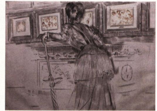
10 Paul Helleu, Devant les Watteau du Louvre , ca. 1895

has to be comprehended dialectically. Fashion is preoccupied simultaneously with its desired acceptance and with its rejection by the public. As long as a gown, a painting, a theatre piece or a moral position is able to shock and disgust the public – ironically, most often the bourgeoisie itself – then the avant-garde is able to exist. If it is too obviously braced within the consumption of the culture industry, it must be replaced by a new avant-garde that rallies against the 'old', and the cyclical process, the unlocking of new investments, can continue.