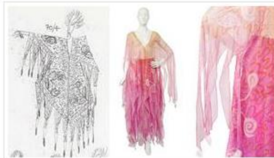
3. The Ukraine and 'Chevron Shawl' collection