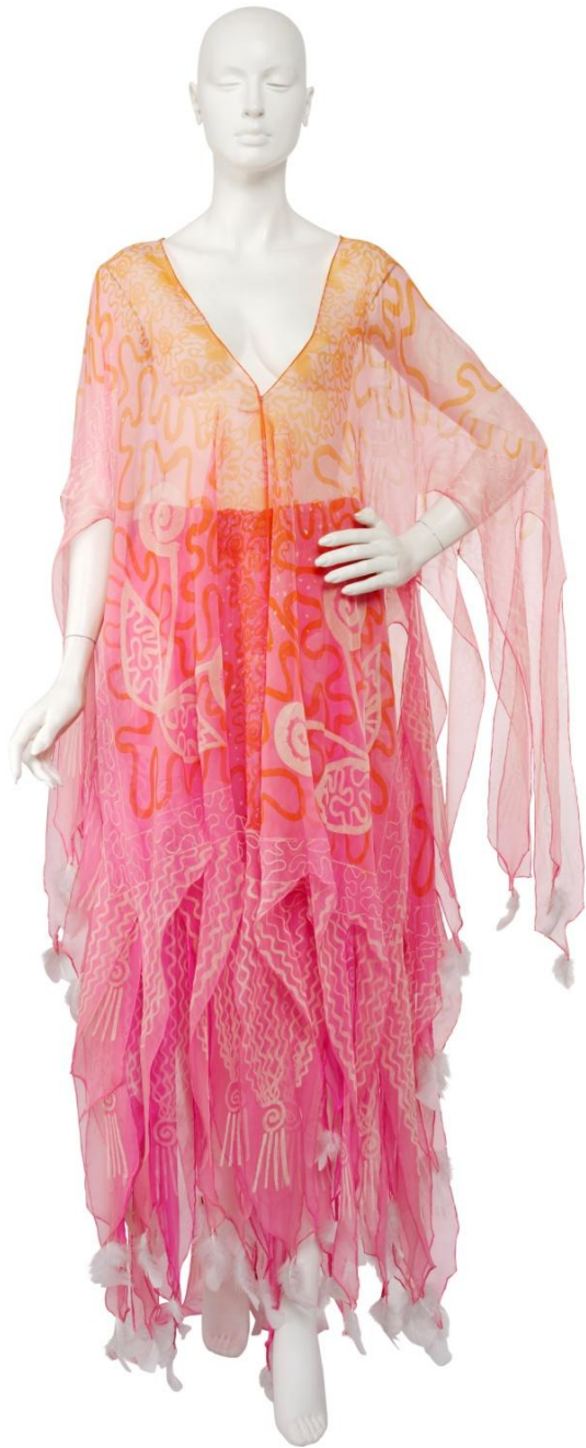
© Zandra Rhodes 2012. Left: Photo by Jon Stokes.