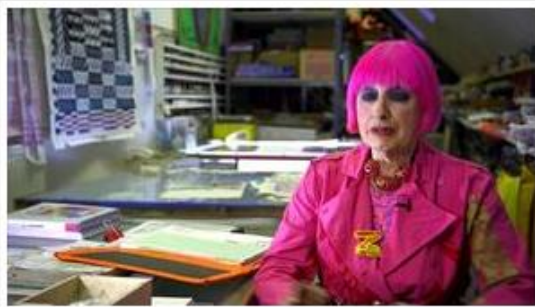
2. The Knitted Circle collection (1969)