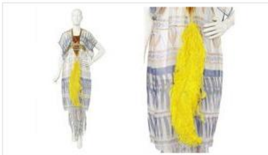
4. New York and 'Indian Feathers' collection