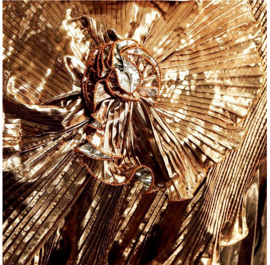
© Zandra Rhodes 2012.