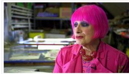
5. Being inspired by museums