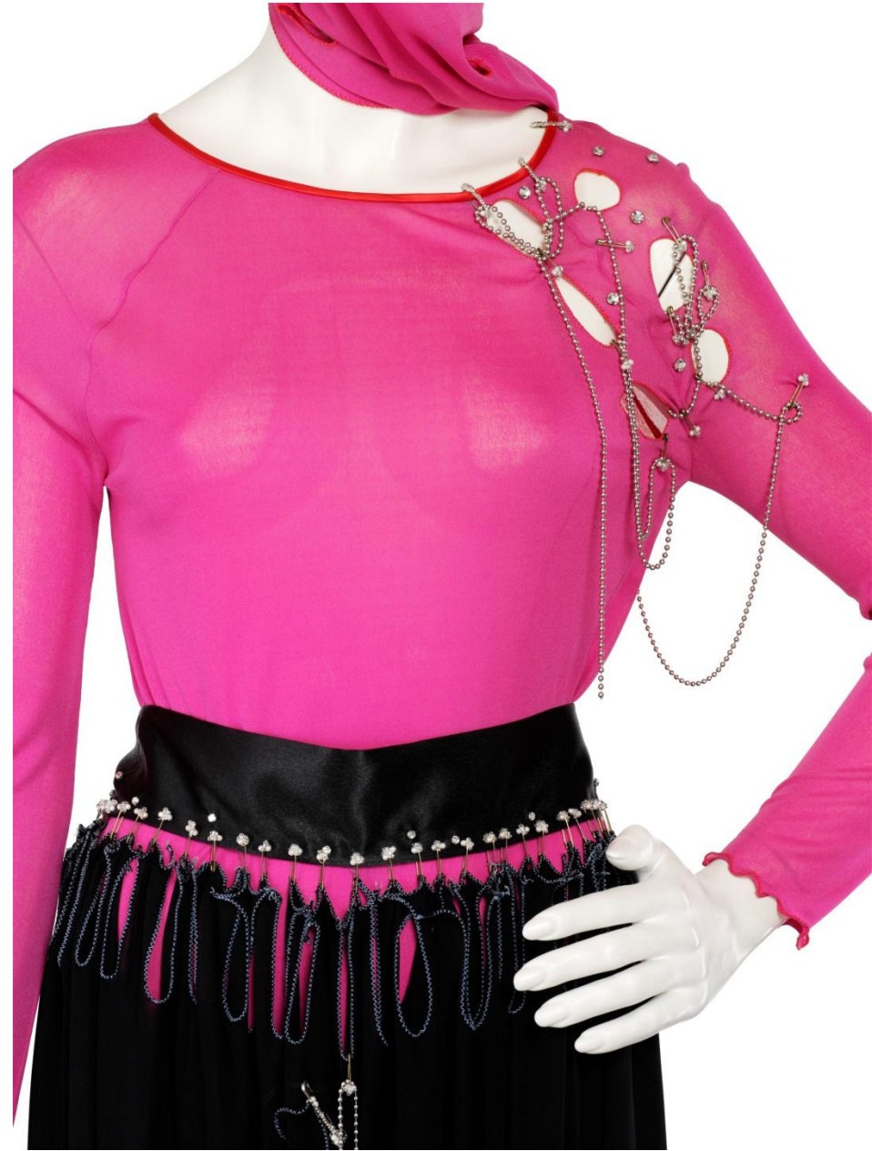
© Zandra Rhodes 2012.