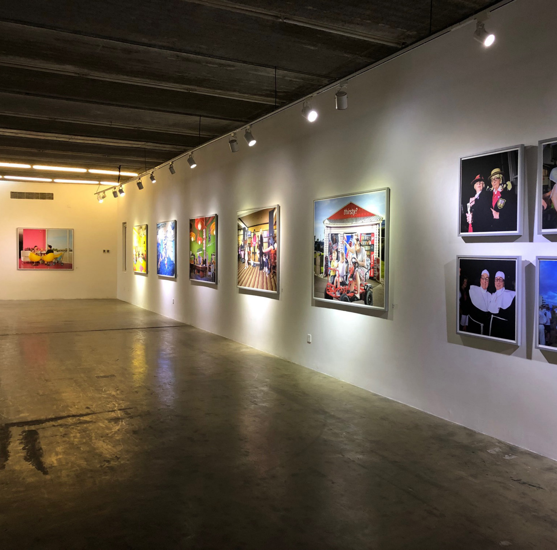
Installation of Resort 2 in Another Way of Telling exhibition, Three Shadows, Beijing