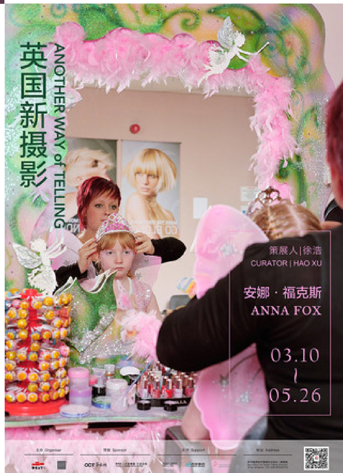
Poster for Another Way of Telling exhibition featuring Resort 1 image