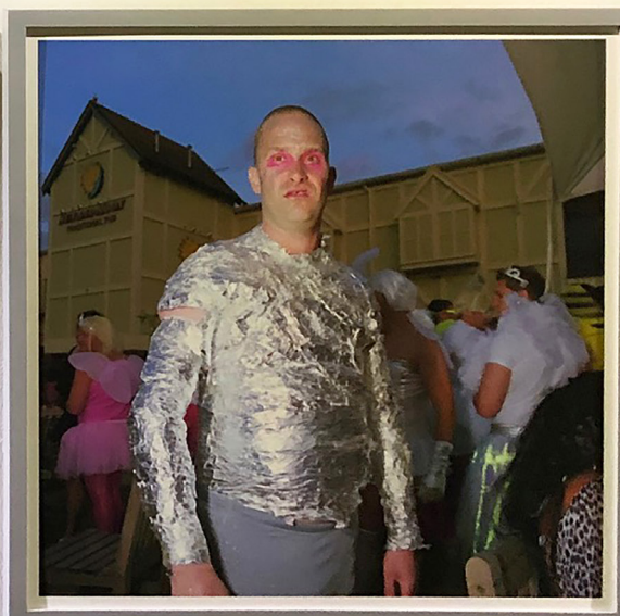
Installation of Resort 2 in Another Way of Telling exhibition, Three Shadows, Beijing