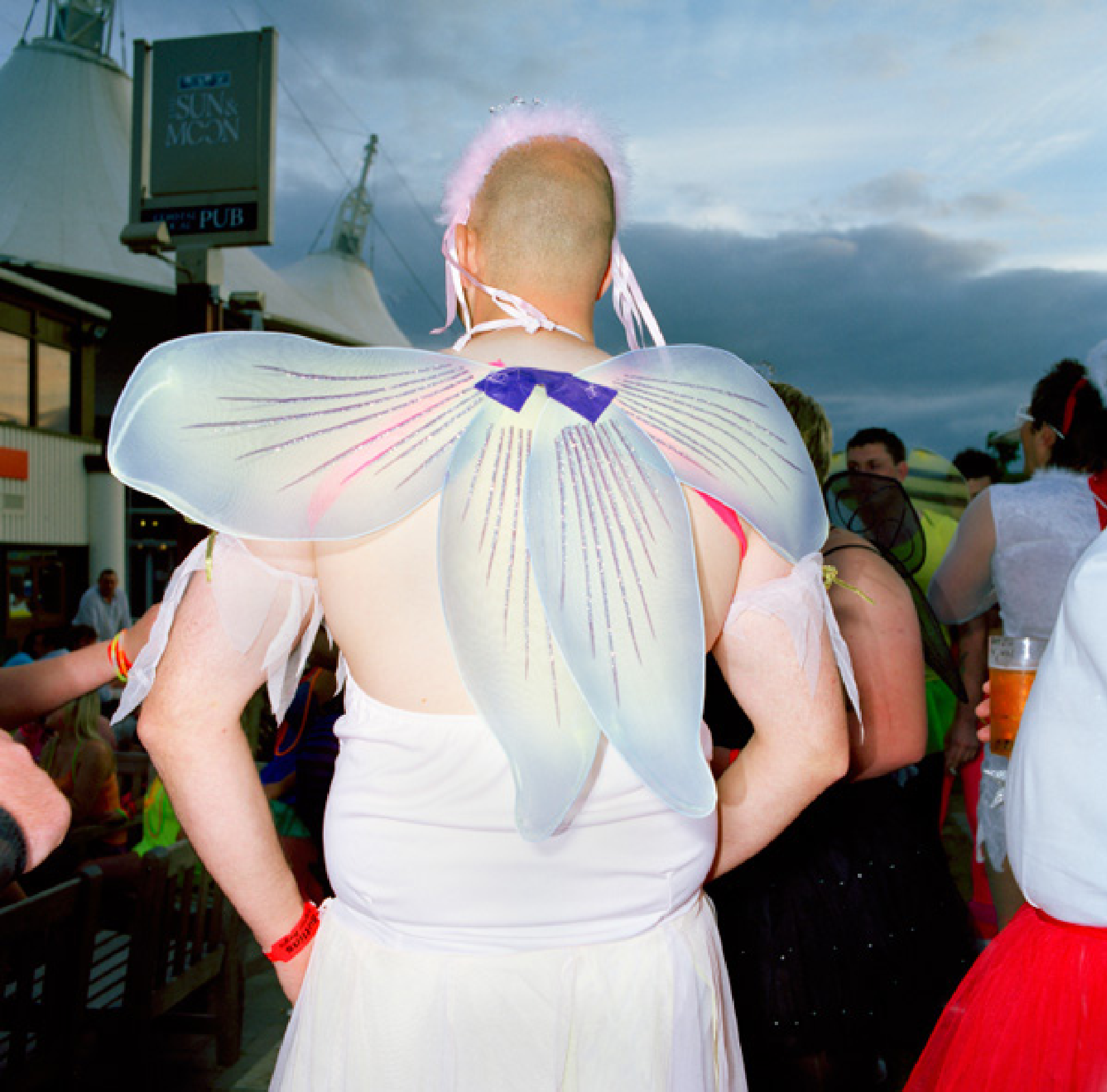
Bar, Centre Stage, 2010