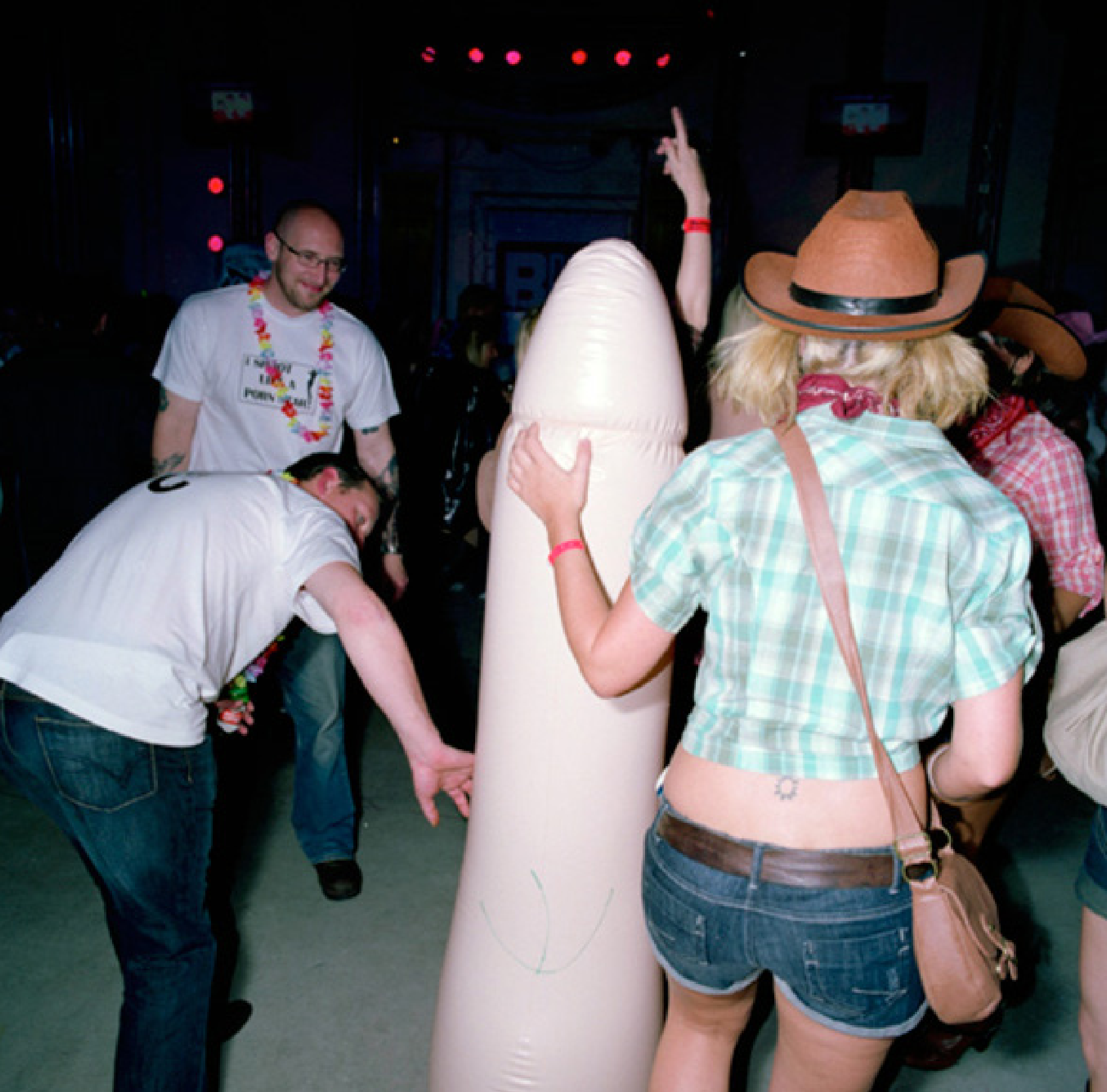
Red arcade, 2010