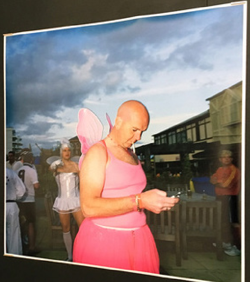
Installation of Resort 2 in Another Way of Telling exhibition