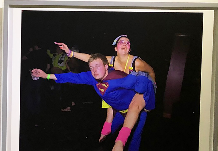
Installation of Resort 2 in Another Way of Telling exhibition, Three Shadows, Beijing