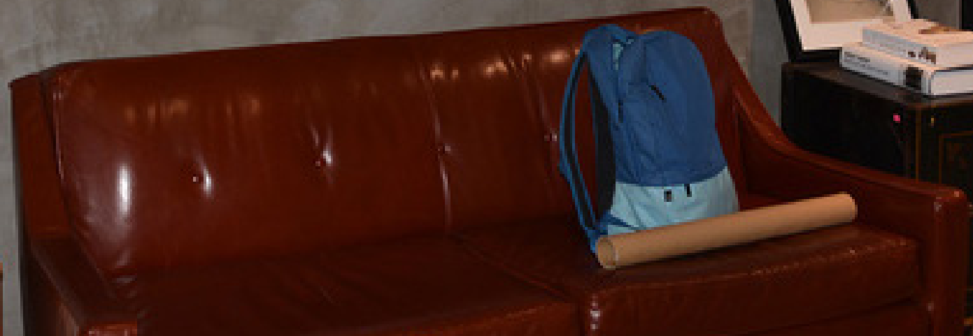
Installation of Resort 2 in Another Way of Telling exhibition