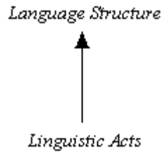
Fig.1.2 LS/LA Relation under a Weberian Stereotype

For the Weberian model, it is the individual speaker who in virtue of LA, creates and sustains LS. If, qua structuralism, LS is viewed as a social object, a Weberian model rejects the reality of LS as nothing more than a façon de parler that can be reduced to the total collective action of speakers (LA). This deflationary account of LS is not truly representative of generativism. Because of the generativist dichotomy between competence and performance, LS would be appropriately seen as a biological endowment of which the I-language is the realised steady state, rather than a ‘social crystallisation’ or E-language. While the I-language is the object of study, it is considered static and universal. This is remarkably similar to structuralism, whose object as Johnson points out ‘is a “shared” system, that is a system that is of interest only insofar as it can be treated as identical from individual to individual’ (Johnson 2000, p.408). In respect of the relationship between LS/LA then, both structuralists (materialists) and generativists (idealists) are in accord.