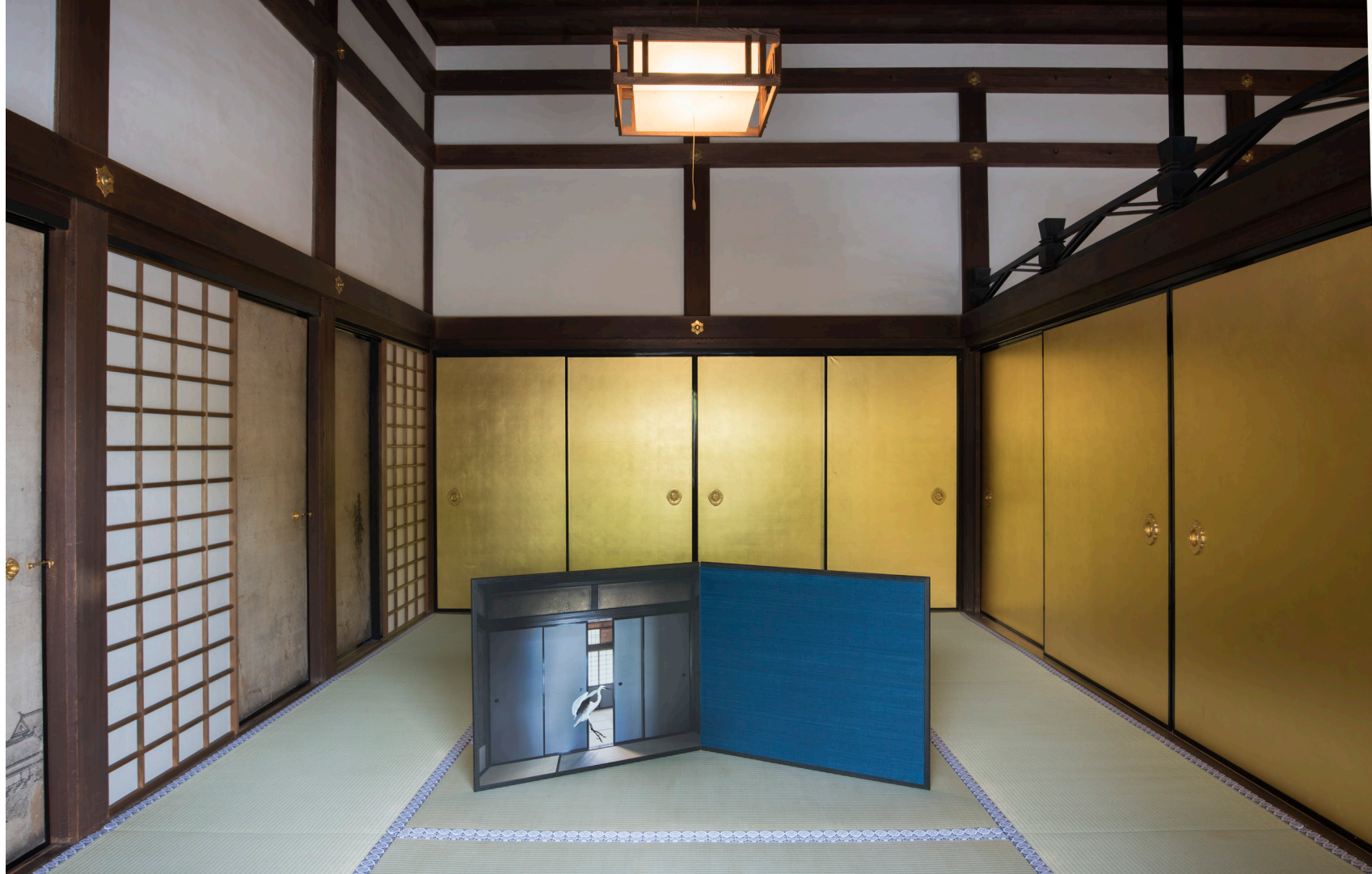
Installation of Once Only, Only Once at Obai-in Temple, 2018 Title: Once Only, Obai-in Standing Screen Byōbu 70cm X 90cm Photograph on Hahnemuhle rice paper, bamboo and silk