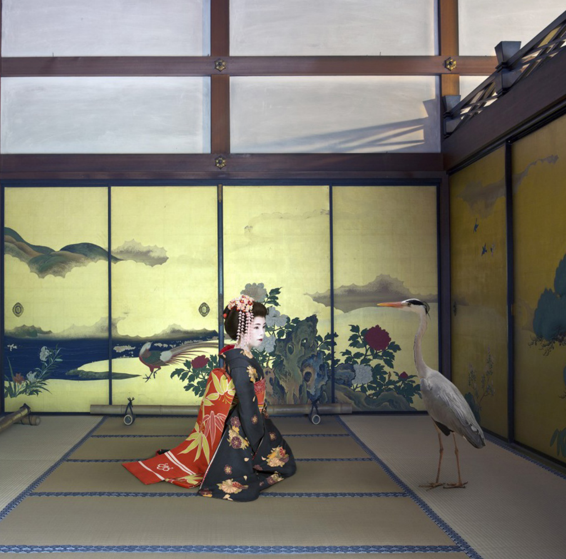
Mono No Aware, Shunko-in Temple, Kyoto, 2015