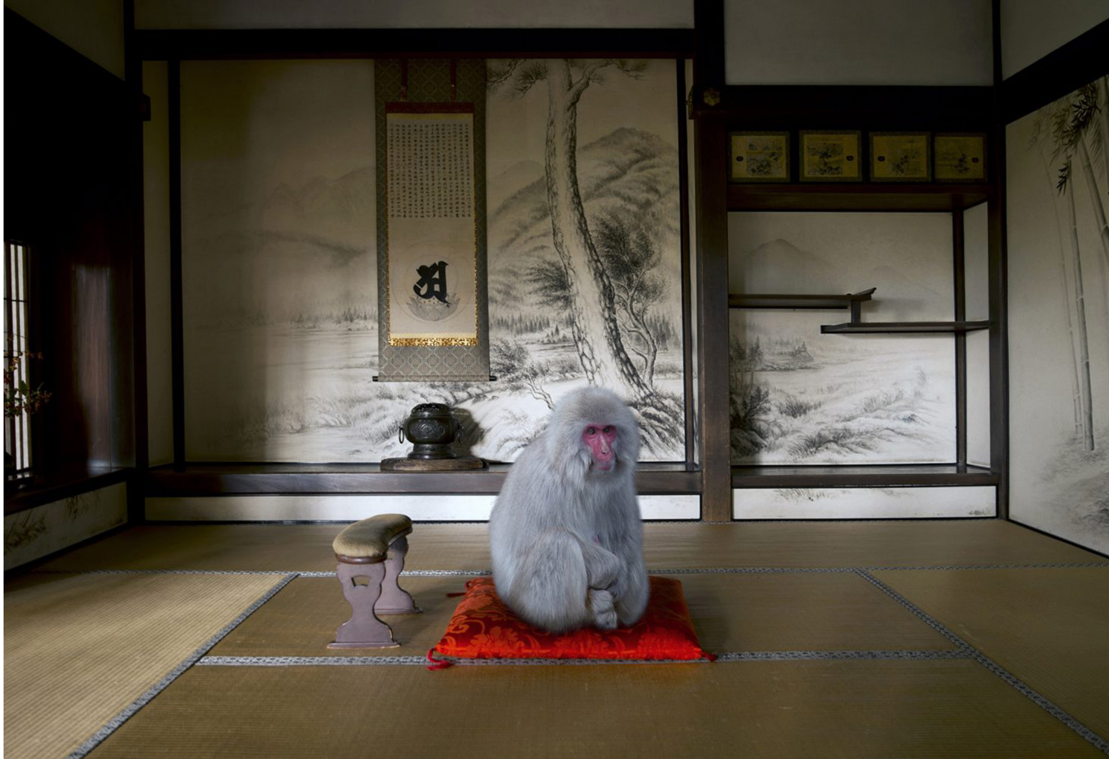
Awakened to Emptiness, Hosen-in Temple, Ohara, 2016