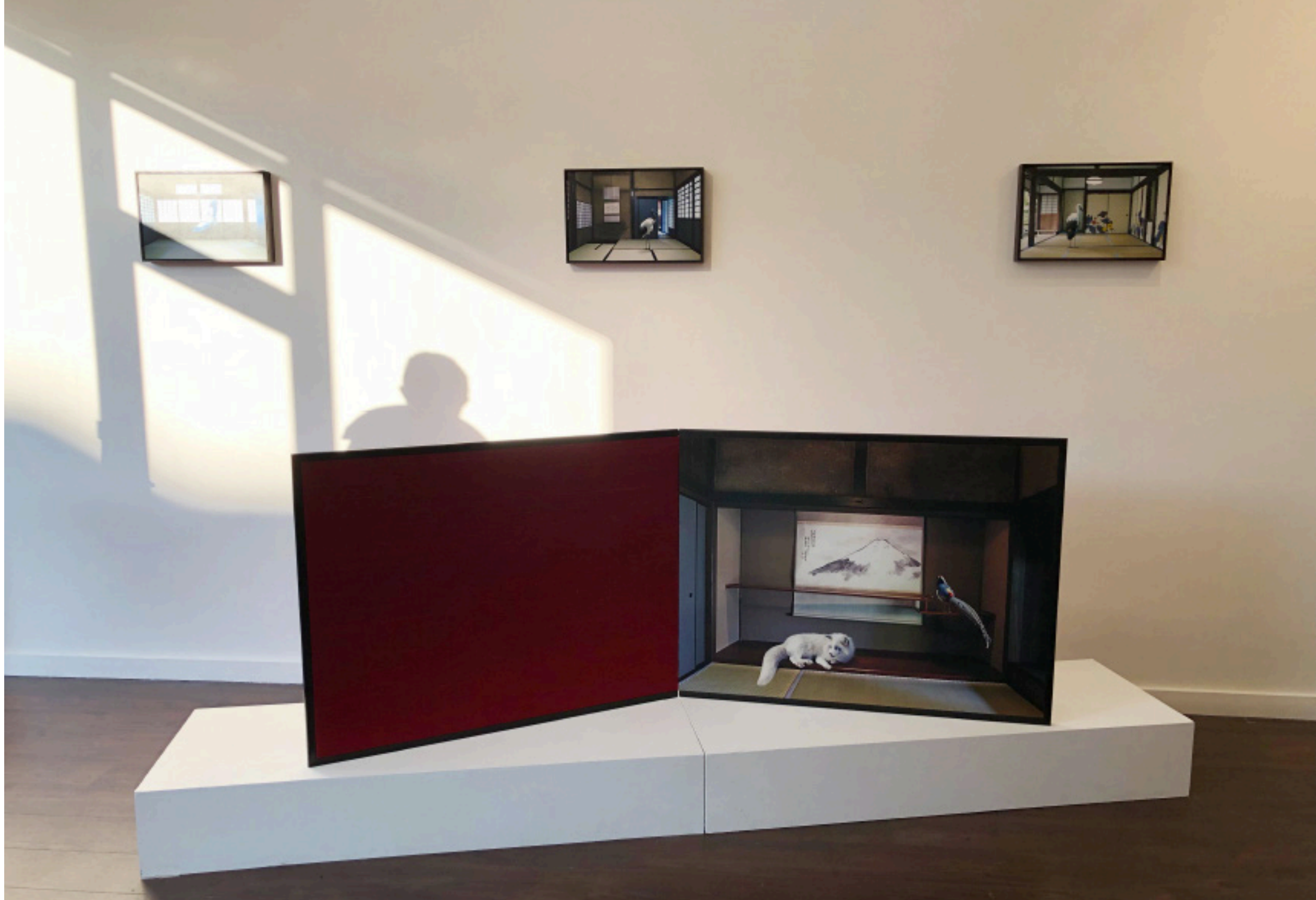
Installation of Once Only, Only Once, at White Conduit Projects, London, 2019 Title: Every Encounter Treasured, Obai-in Standing Screen Byōbu 70cm X 90cm Photograph on Hahnemuhle rice paper, bamboo and silk