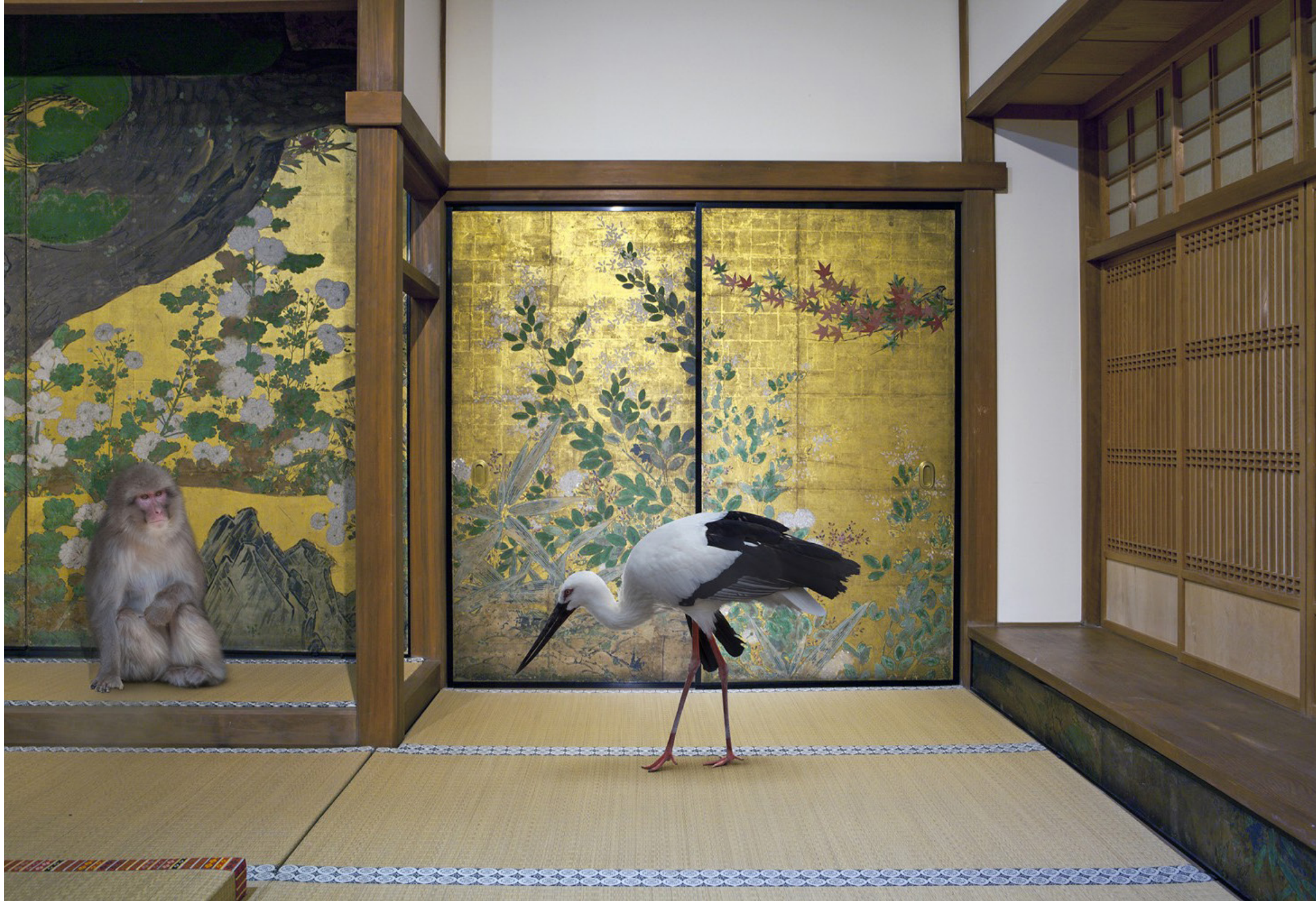
Cultivating Happiness, Chishaku Temple, Kyoto, 2016