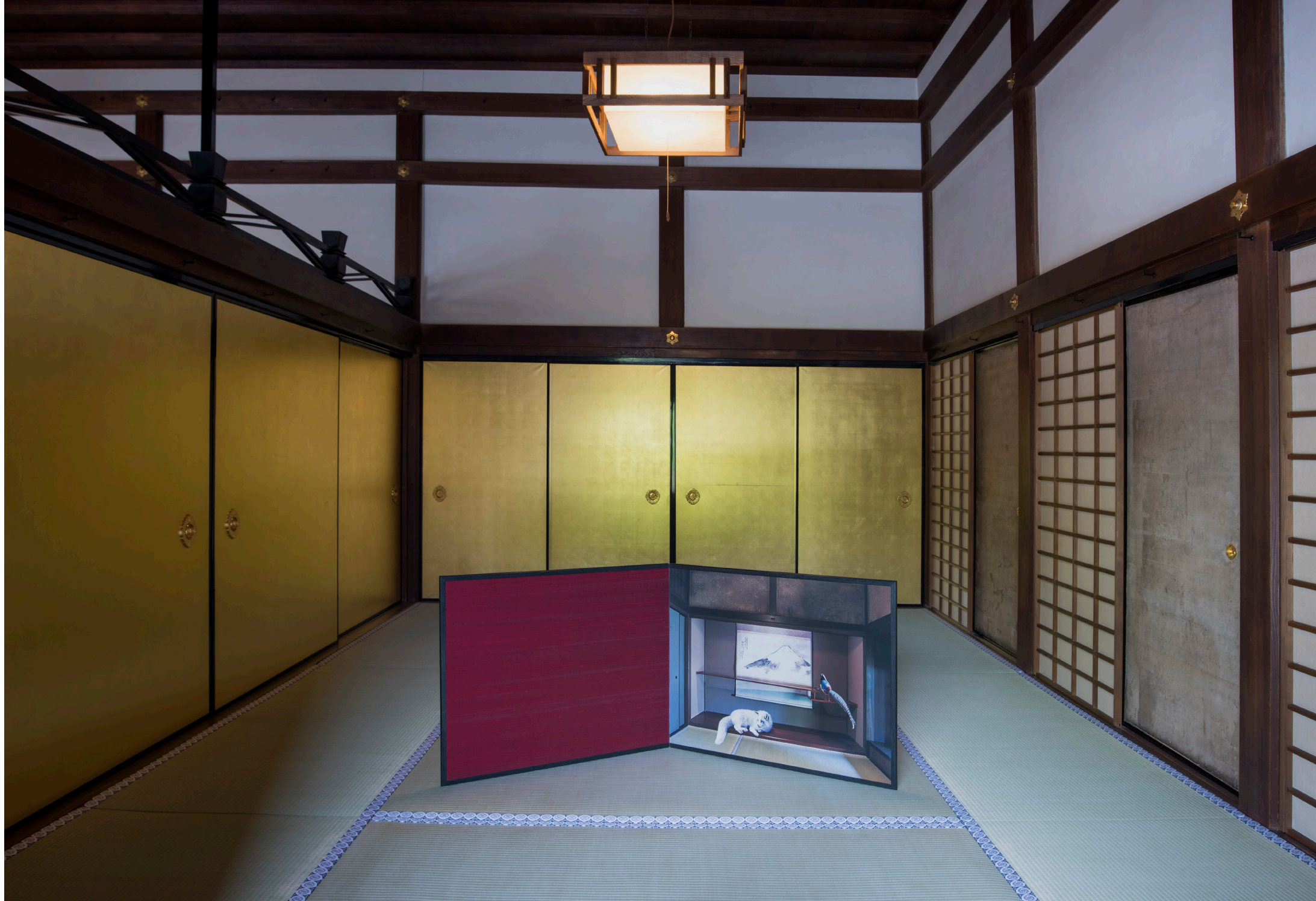
Installation of Once Only, Only Once at Obai-in Temple, 2018 Title: Every Encounter Treasured, Obai-in Standing Screen Byōbu 70cm X 90cm Photograph on Hahnemuhle rice paper, bamboo and silk