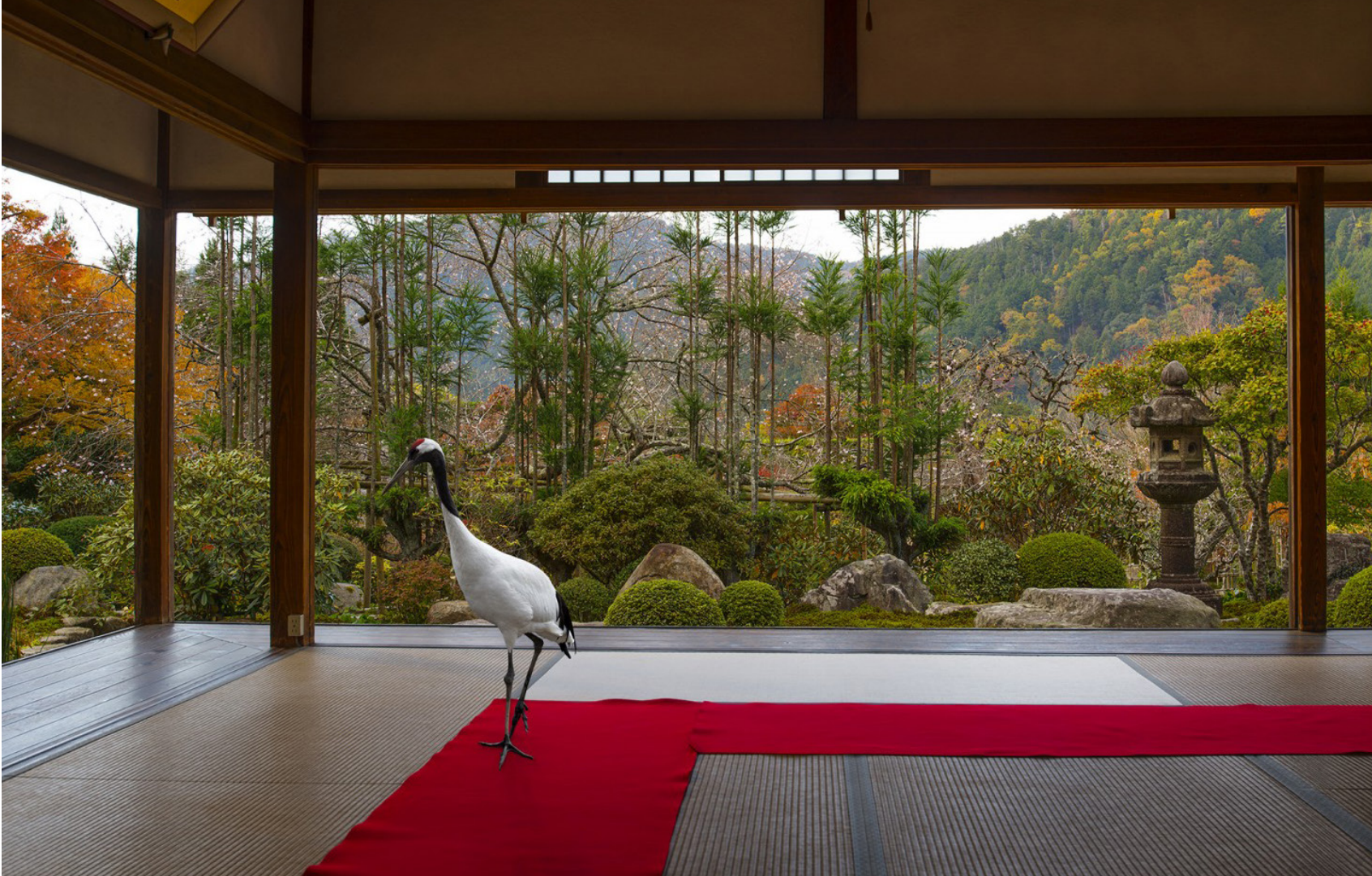
Journey to the Great Sage, Jikko-in Temple, Ohara, 2015