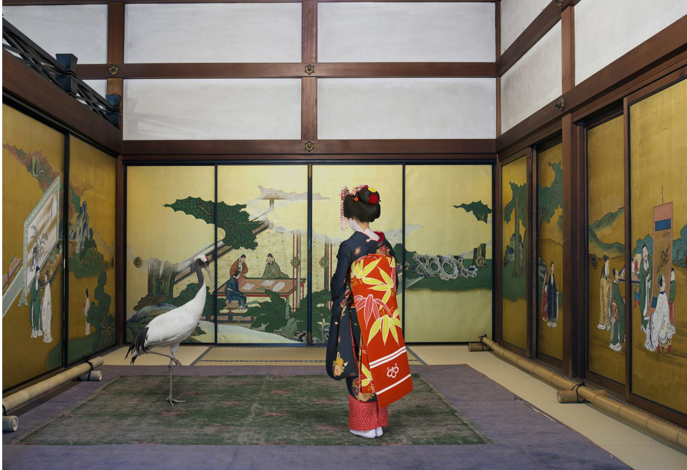
Akirame, Shunko-in Temple, Kyoto, 2015