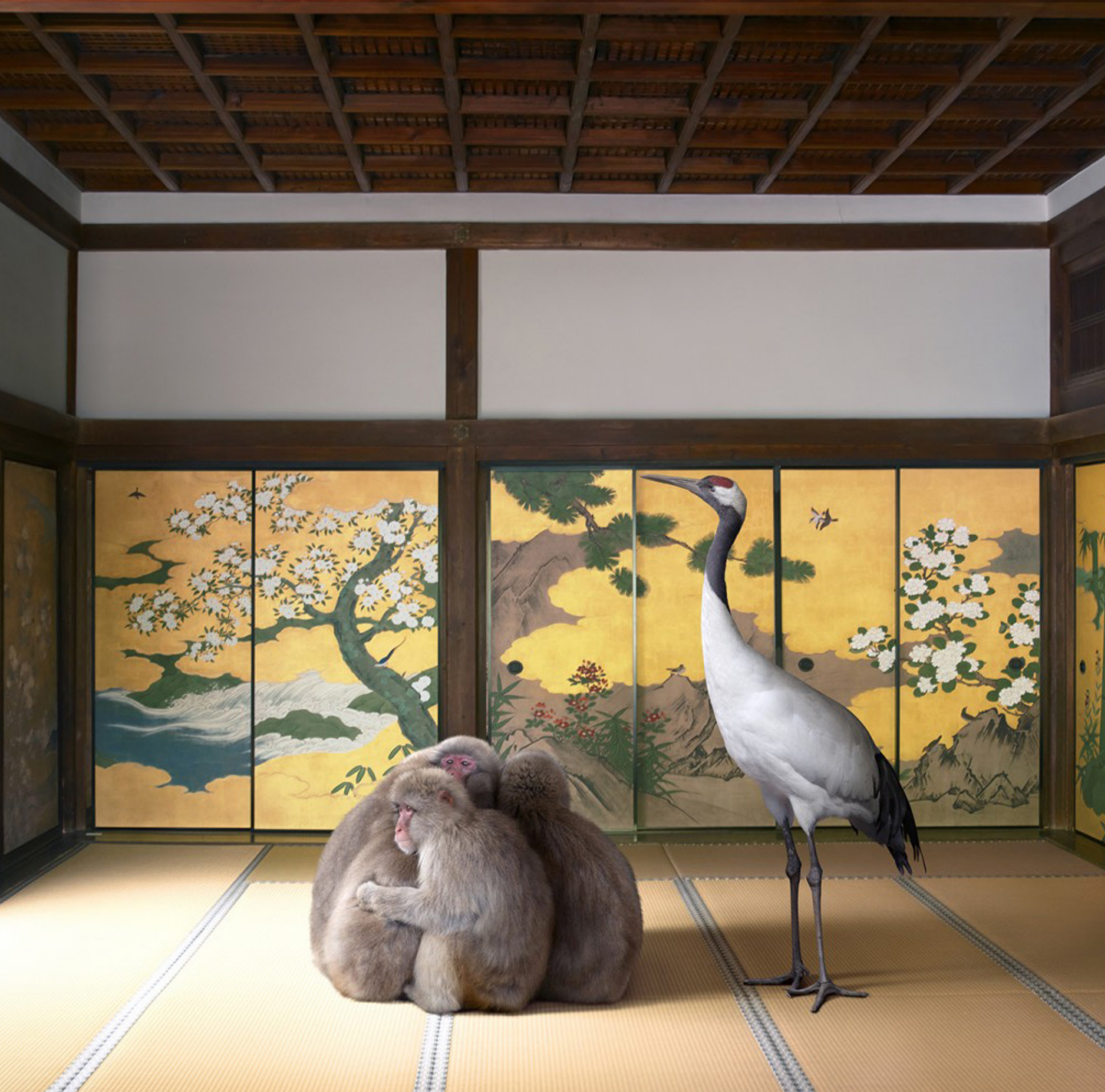
Mono No Aware, Shinku-in Temple, Kyoto, 2014