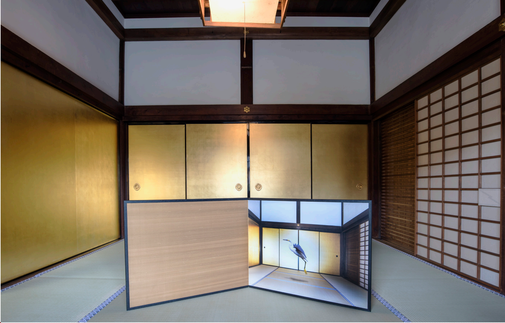
Installation of Once Only, Only Once at Obai-in Temple, 2018 Title: Form No Other Than Emptiness, Obai-in Standing Screen Byōbu 70cm X 90cm Photograph on Hahnemuhle rice paper, bamboo and silk