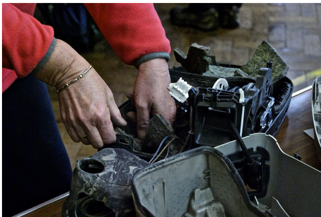
Fig 2. Vacuum cleaner repair

FRC actively promotes the impact of its monthly sessions through social media and has been featured on national and local radio, Brazilian television and local press. Awareness of FRC is beyond the local community and it has been consulted by a new repair cafe start-up in Northern Ireland and visited by others from Surrey, Hampshire and Essex; FRC sees supporting the set-up of other repair cafes as part of its wider mission.