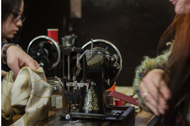
Fig 3. Clothing repair

(11%); and internal or external wiring failures – excluding power cords (7%).