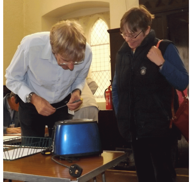
Fig 4. Toaster Diagnosis

Over 36 sessions, the FRC repair rate is 63%, which is in line with the global average of 63% (Charter & Keiller, 2016b). FRC repair rate is still intuitively very high given that there is only 2.5 – 3 hours to repair products per session, and a small group that complete repairs at home workshops.