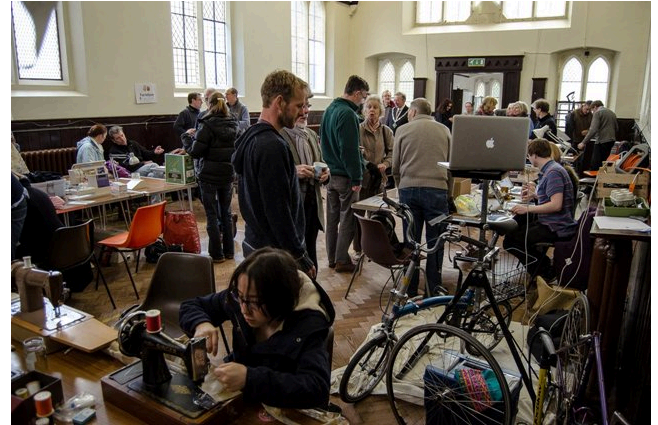
Fig 2. Farnham Repair Cafe

thirty-six, 2.5 hour sessions. Repair stations are organised for a range of consumer products e.g. electronics, mechanicals, bicycles, clothing, furniture and creative (upcycling). Volunteer repairers bring their own tools and equipment, and a number of repairs are finally completed by volunteers at 'home workshops'. The FRC management team have developed methodologies to collect data to measure the impact of activities.