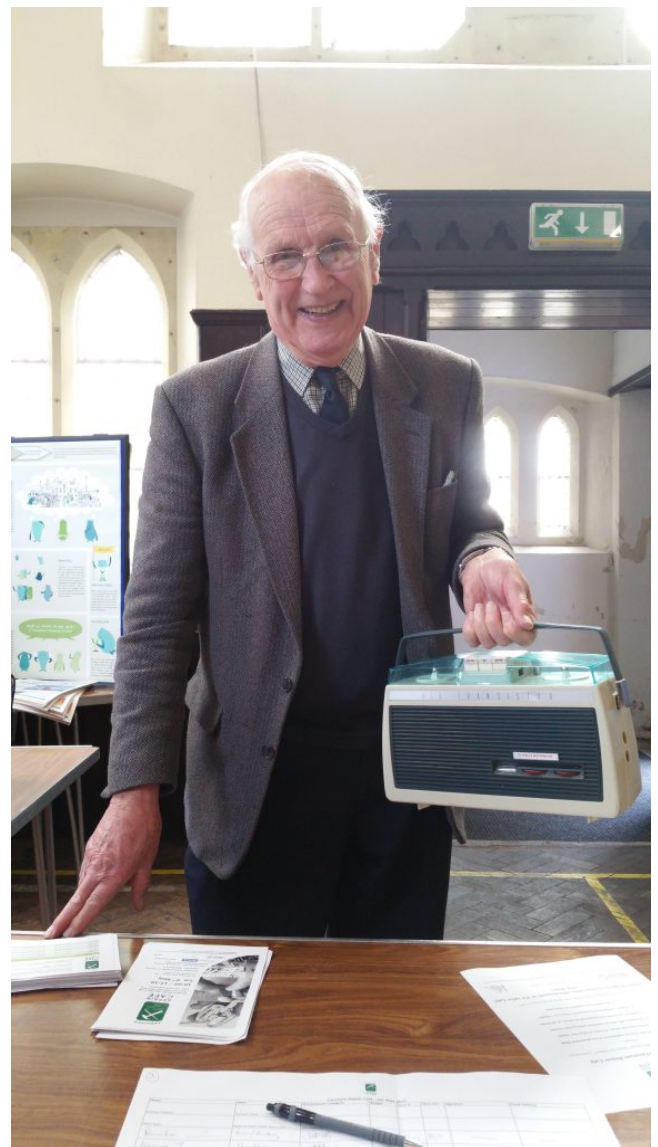
Fig 5. A tape recorder is fixed

additional research amongst FRC visitors was completed by the Open University that was presented as a research paper at a conference (Dewberry et al, 2016). FRC is presently considering the development of additional added-value services for the local community, and increased dissemination its experience and understanding.