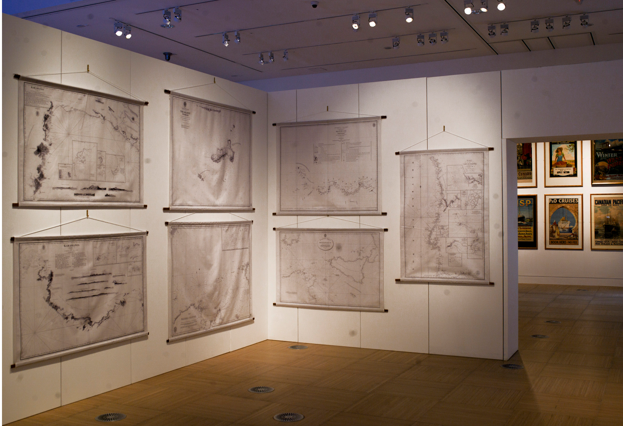
Installation shot of Ship to Shore, SeaCity Museum. Simon Patterson, Cousteau in the Underworld, 2008 25 Fabric charts.