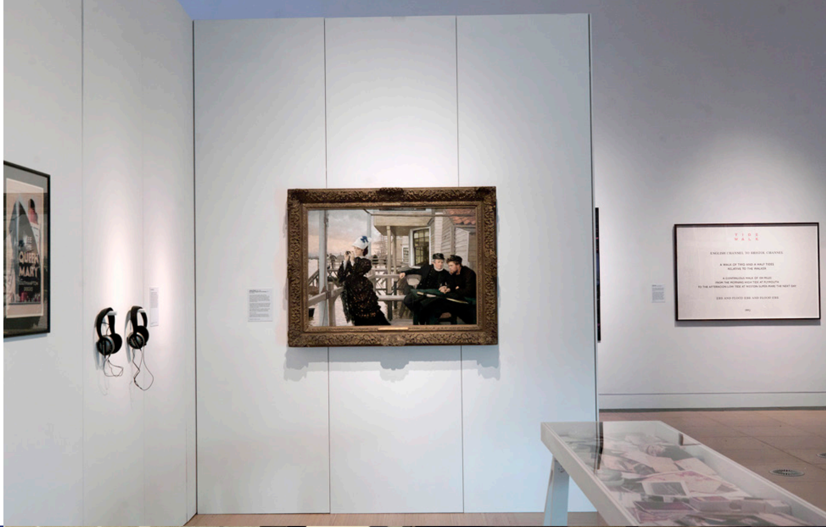
Installation shot of Ship to Shore, SeaCity Museum. James Tissot (1836–1902), The Captain's Daughter or The Last Evening, 1873, Oil on canvas. In background: Richard Long, Tide Walk, Weston-super-Mare, England, 1992, Text.