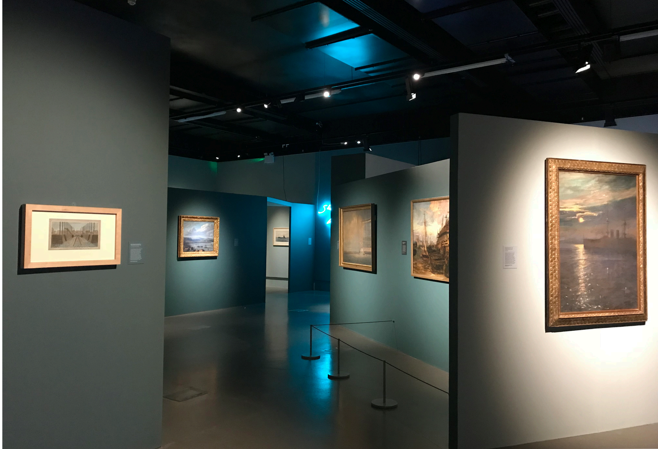
Installation view of Powerful Tides: 400 years of Chatham and the Sea, The Historic Dockyard Chatham