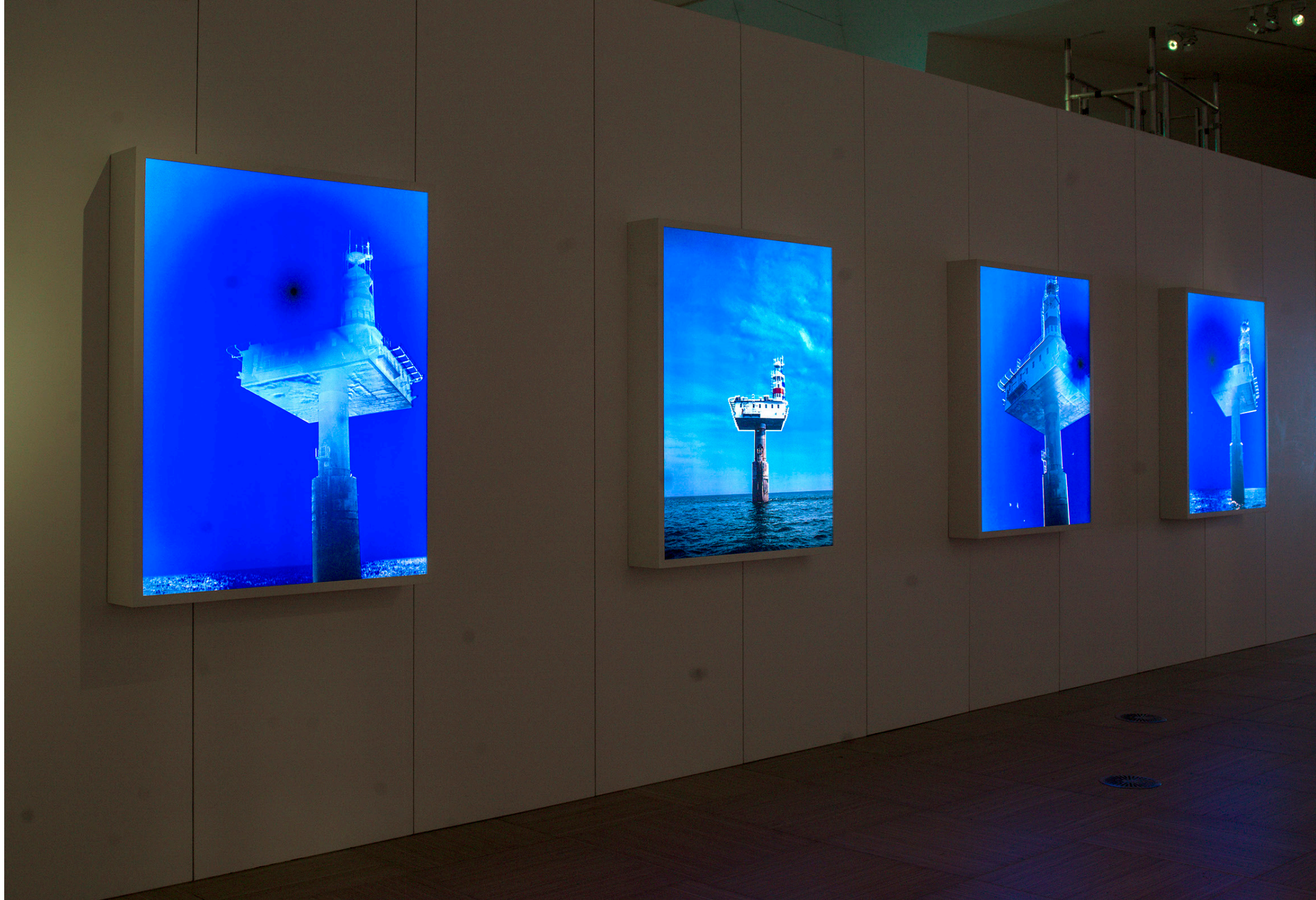
Installation shot of Ship to Shore, SeaCity Museum. Catherine Yass, From Right to left: Lighthouse (North North West), 2011, Lighthouse (North), 2011, Lighthouse (North West), 2011, Lighthouse (North North North West), 2011, Duratrans transparency, lightbox.