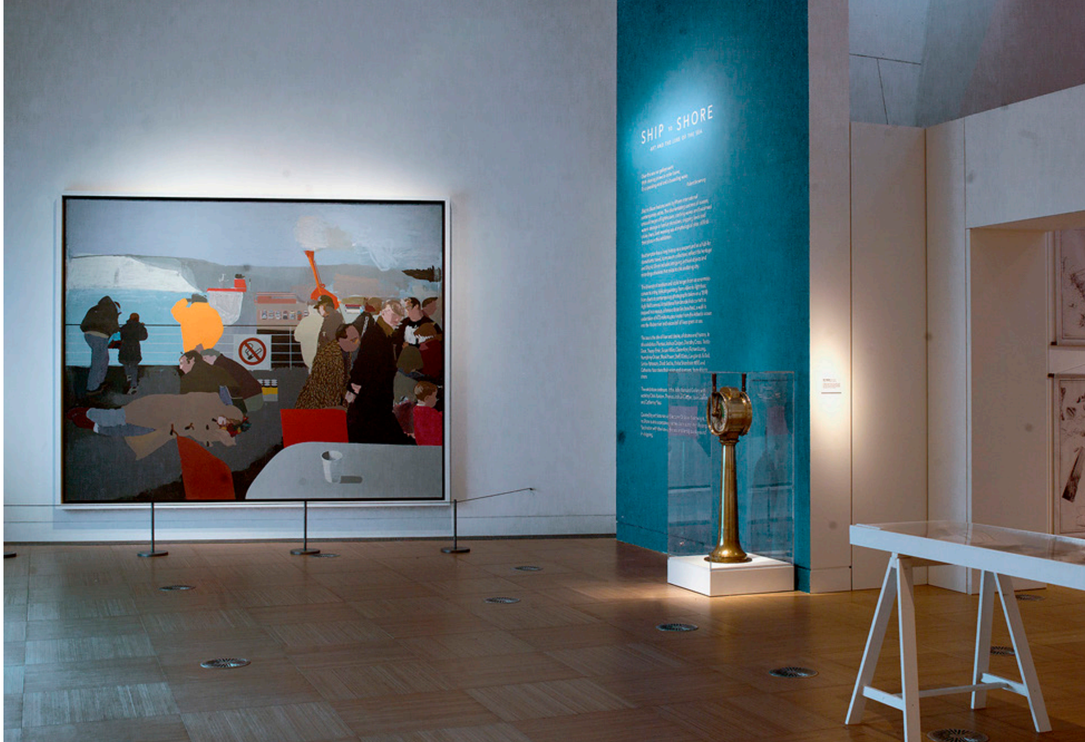
Installation shot of Ship to Shore, SeaCity Museum. Humphrey Ocean, The First of England, 1999, Oil on canvas.