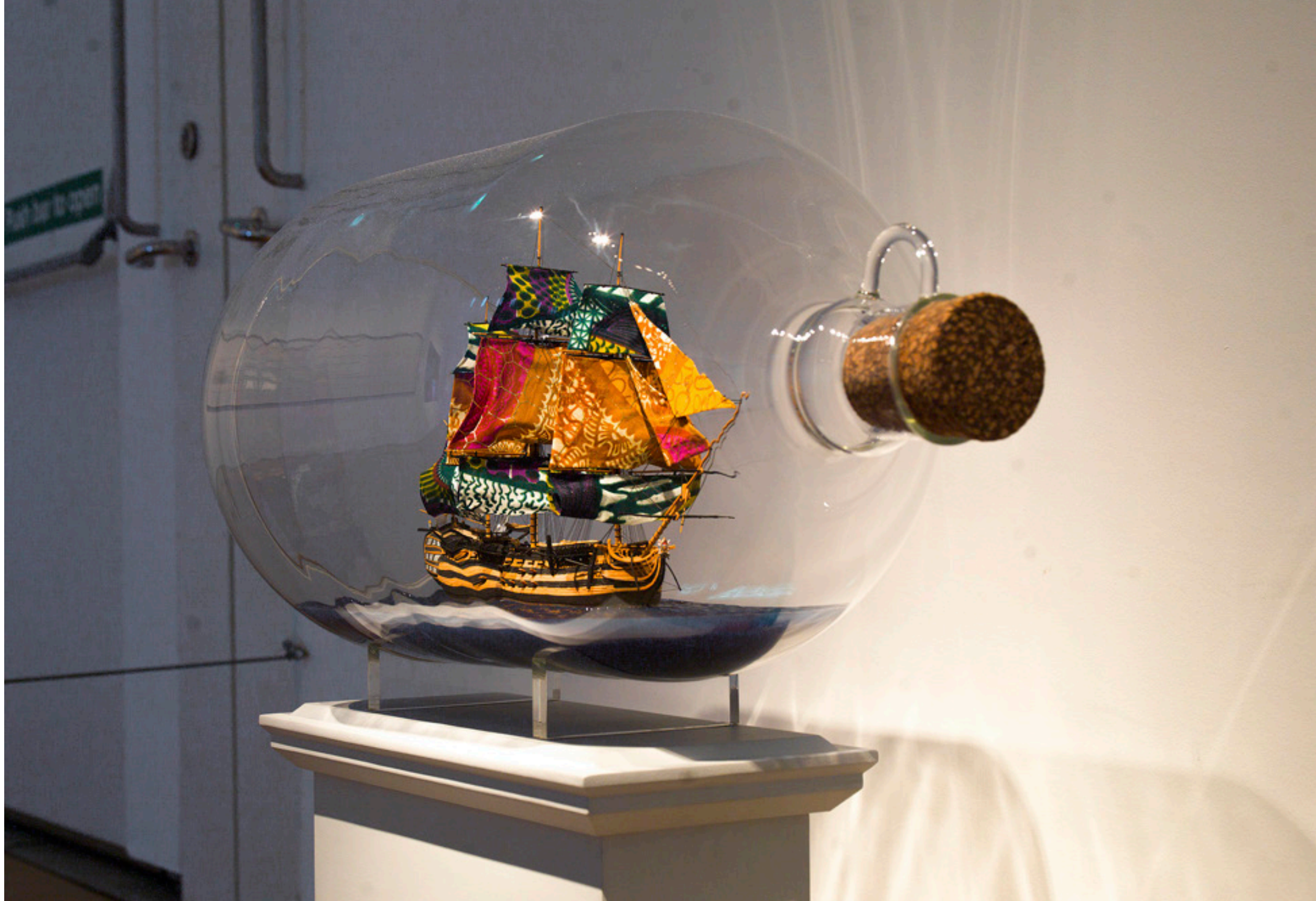
Installation shot of Ship to Shore, SeaCity Museum. Yinka Shonibare, Nelson's Ship in a Bottle, 2010 Plastic, Dutch wax-printed cotton textile, cork, acrylic and glass bottle.