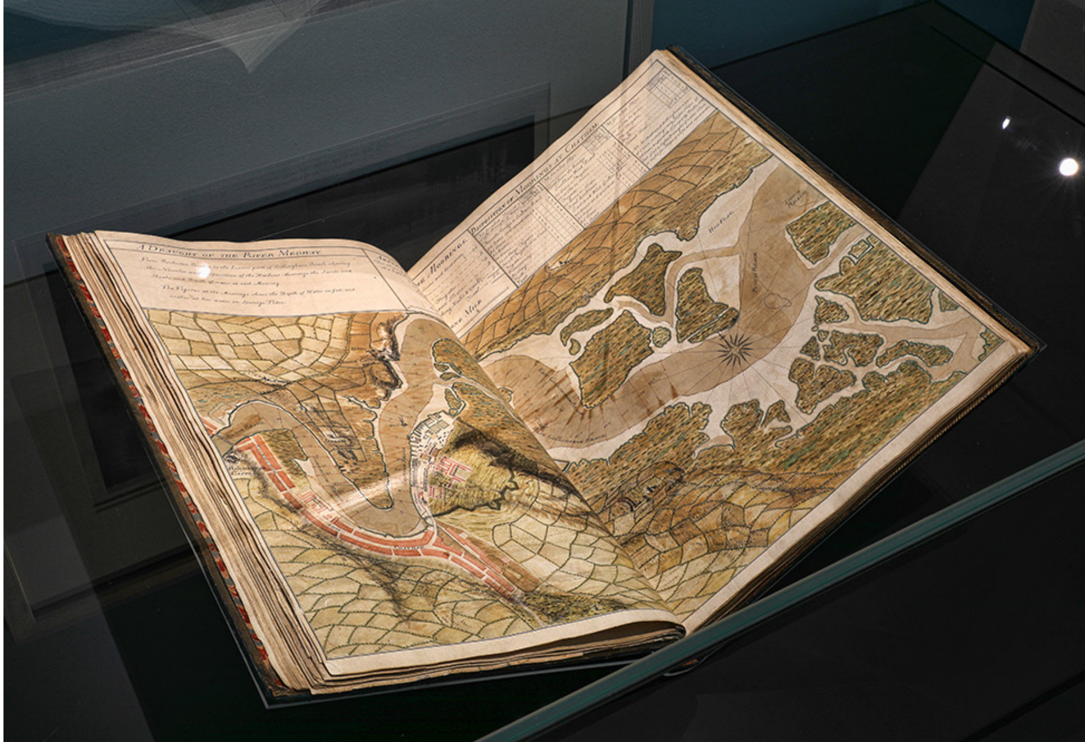
Installation shot of Powerful Tides: 400 years of Chatham and the Sea, The Historic Dockyard Chatham. View of Chatham, 1698, Kings Manuscript 43, ff. 5v-6.