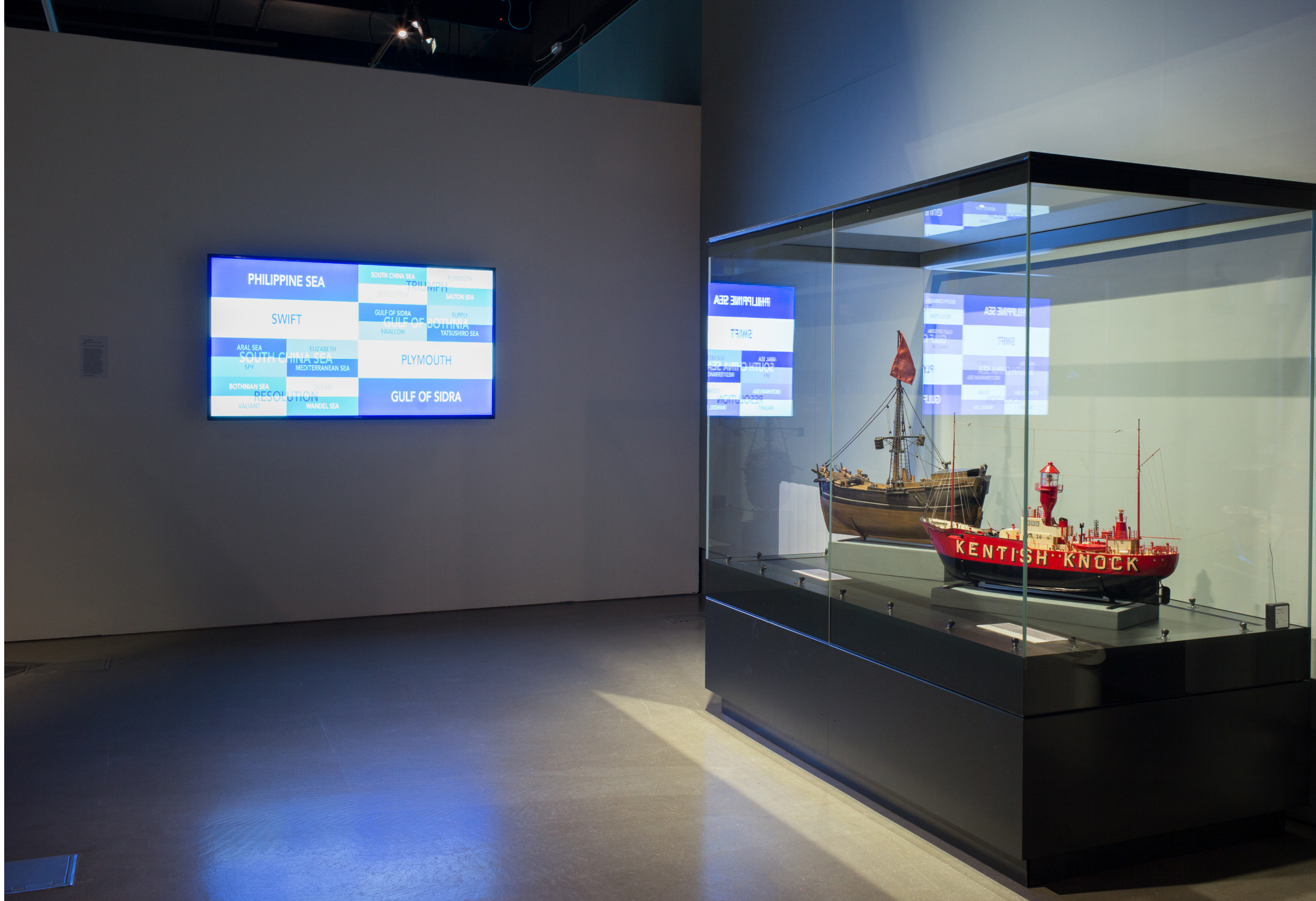
Installation shot of Powerful Tides: 400 years of Chatham and the Sea, The Historic Dockyard Chatham. Models of Lightships. Langlands & Bell, Into the Blue, 2014, in background.